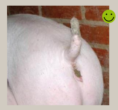
Healed dry crust, no inflammation.