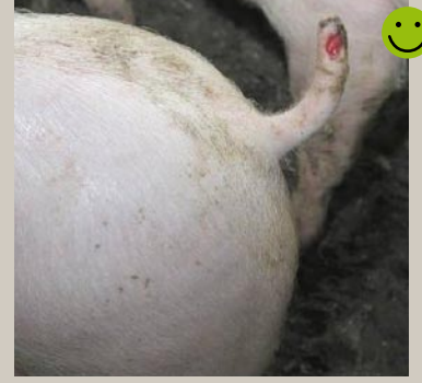
Tail with superficial ulcer that only affects the skin.