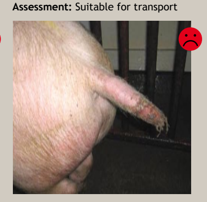
Acute tail bite with clear inflammation.