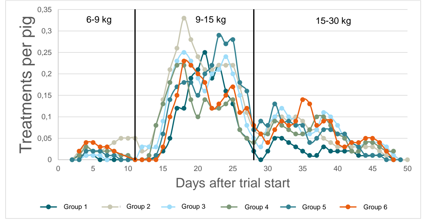
Figure 2: Average number of treatments per pig, days after trial start.

Interestingly, in phase 2 treatment days per pig were significantly lower in group 1 (1.6 days) compared with group 2 (2.4 days) despite the fact that the feed no longer contained ZnO. This points to a possible 'long term effect' of ZnO on gut health. This observation was also made in two previous trials [10], [11]. The body is quick to excrete ZnO and no carry over effect was observed on productivity, but it is possible that ZnO has a positive effect on the microflora or gut health that lasts even after zinc is no longer used.