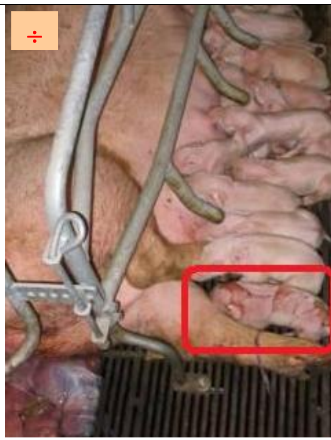
This piglet must be assured of colostrum.