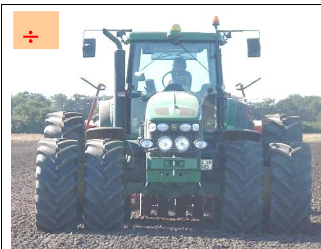
Lack of work plans may result in misunderstandings