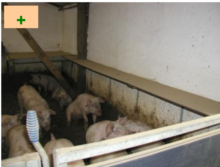
3. Intake of cold air triggered by obstacles crosswise the air. Can be set right by covering with a board.